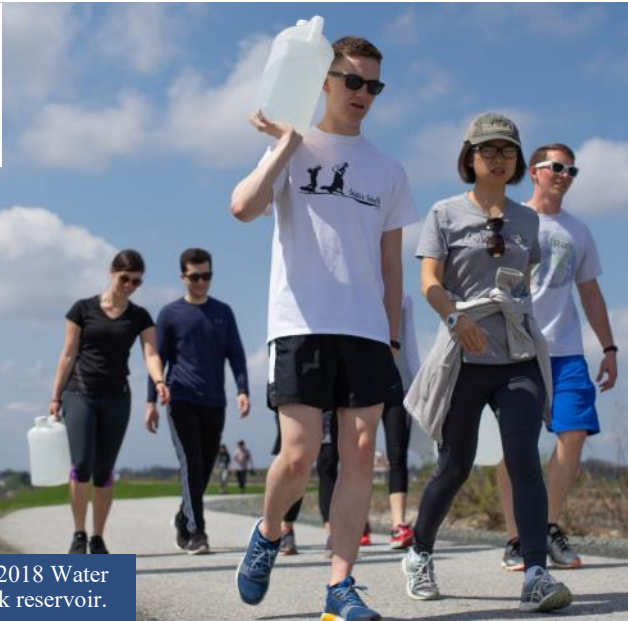
Participants in the 2018 Water Walk at the Newark reservoir.

I used to use a donkey to walk 10km to get water every day. Thanks to the support of people like you, my life has improved. I now have easy access to clean water.