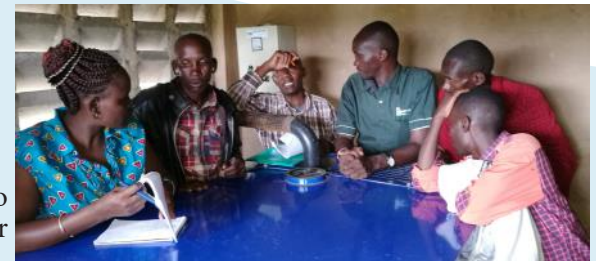
Members of the nine water management committees met as a group to discuss setting fair and appropriate prices and how they can collect enough revenue to maintain the wells and avoid service interruptions.

We then moved out of the classroom into the field for a hands-on diesel generator operation maintenance and troubleshooting session. The Lenkiloriti borehole committee hosted us and proudly showed off their well-